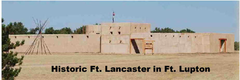
Historic Ft. Lancaster in Ft. Lupton

Depart 10:30 a.m.—Starbucks 13640 Orchard Parkway, Westminster, CO 80023